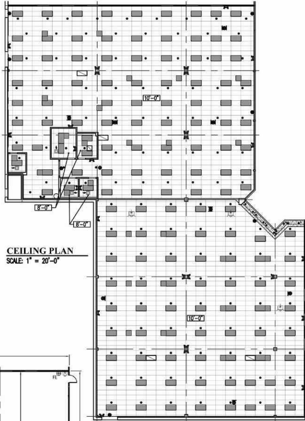
CEILING PLAN SCALE: 1" = 20'-0"